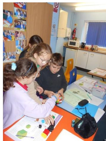
Year 5 children working hard in maths!