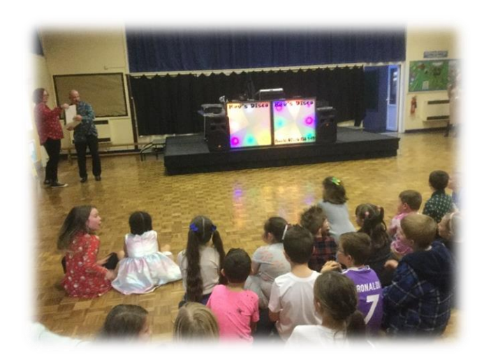
We all had fun at the disco last week.

Thank you for all your kind donations for our Rudolph Dash. We raised a staggering £439.30 for Nelson's Journey.